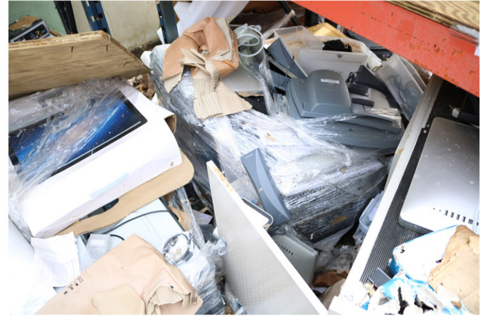
Fixed Assets Management_126.jpg