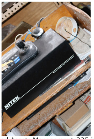
Fixed Assets Management_235.jpg