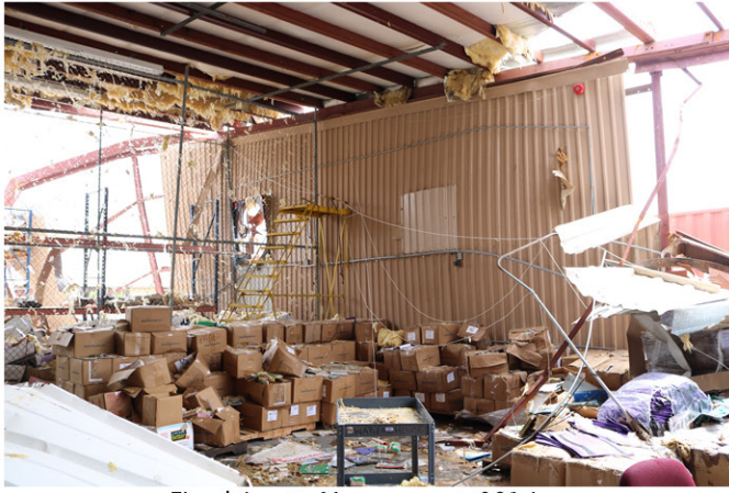
Fixed Assets Management_091.jpg