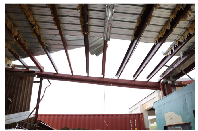
Fixed Assets Management_087.jpg