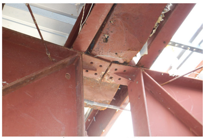
Fixed Assets Management_084.jpg