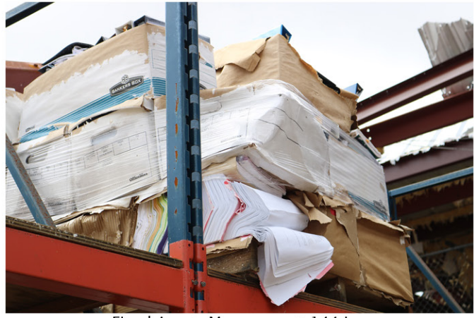
Fixed Assets Management_144.jpg