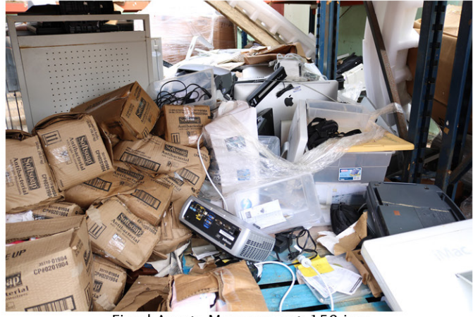
Fixed Assets Management_158.jpg