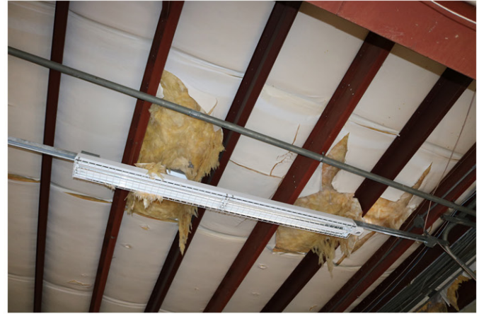
Fixed Assets Management_081.jpg