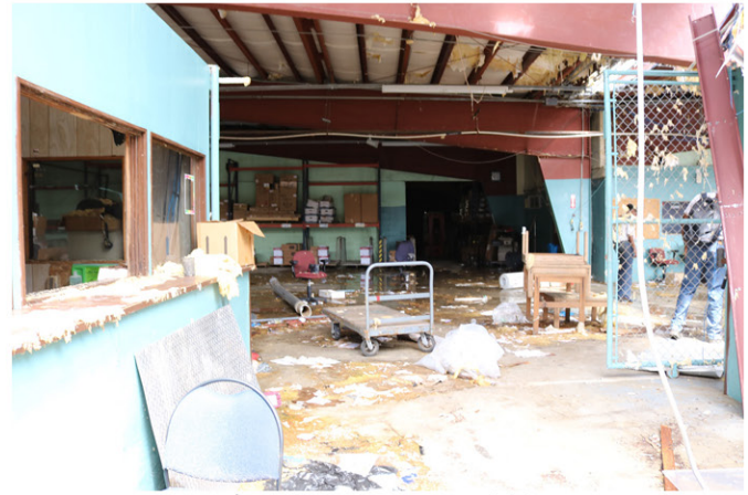
Fixed Assets Management_062.jpg