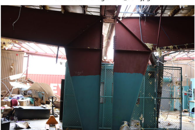
Fixed Assets Management_083.jpg