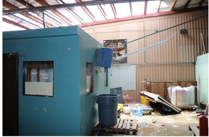
Fixed Assets Management_068.jpg