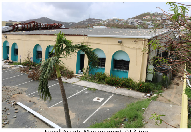
Fixed Assets Management_013.jpg