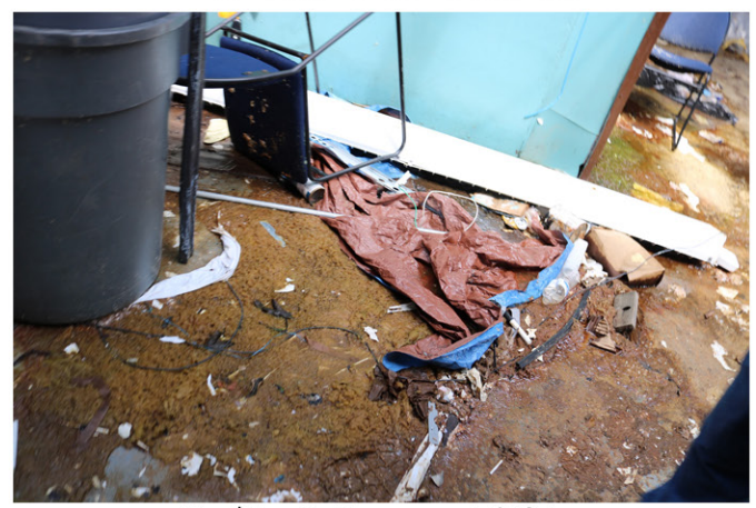
Fixed Assets Management_053.jpg