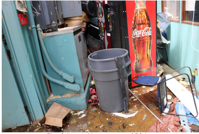
Fixed Assets Management_059.jpg