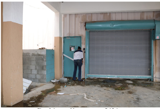
Fixed Assets Management_249.jpg