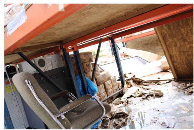
Fixed Assets Management_131.jpg