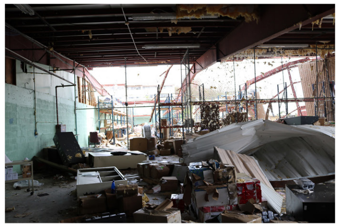
Fixed Assets Management_230.jpg