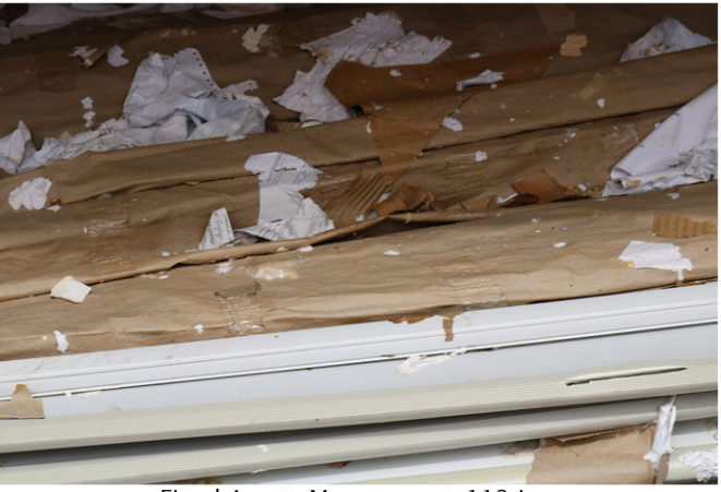
Fixed Assets Management_112.jpg