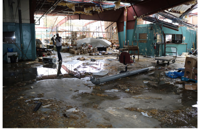
Fixed Assets Management_076.jpg