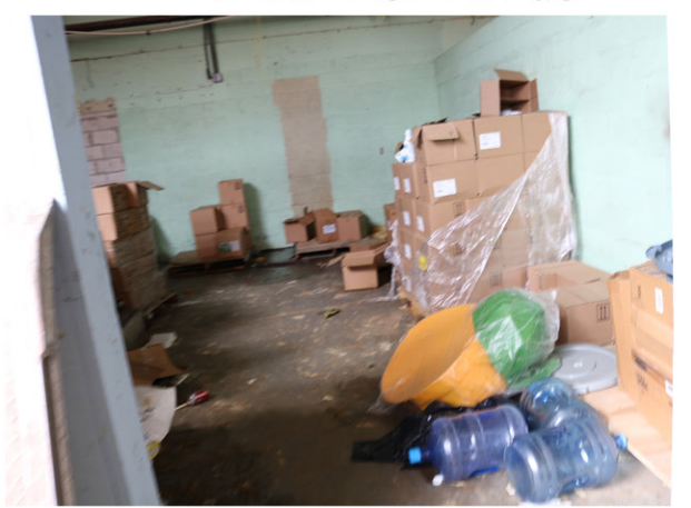
Fixed Assets Management_069.jpg