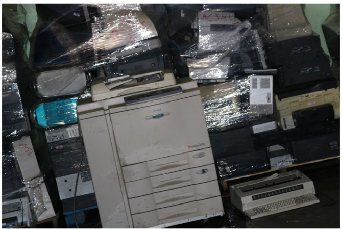
Fixed Assets Management_073.jpg