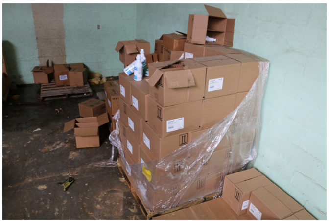
Fixed Assets Management_071.jpg