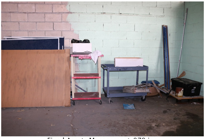
Fixed Assets Management_079.jpg