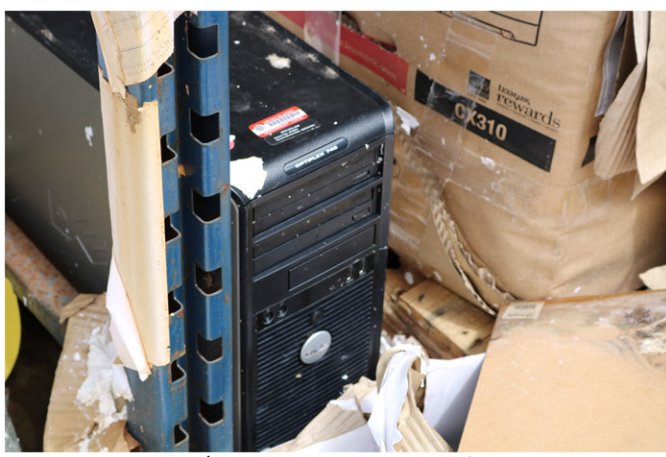
Fixed Assets Management_119.jpg