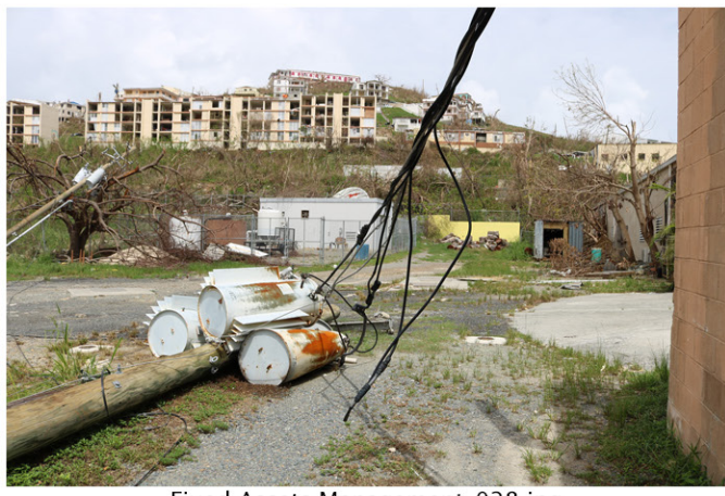
Fixed Assets Management_028.jpg