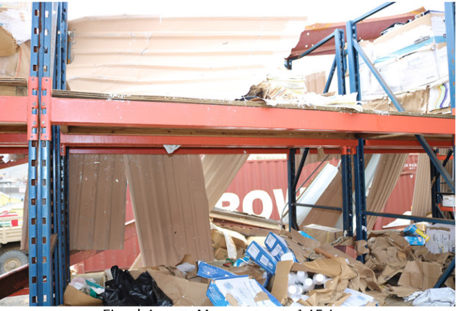
Fixed Assets Management_145.jpg