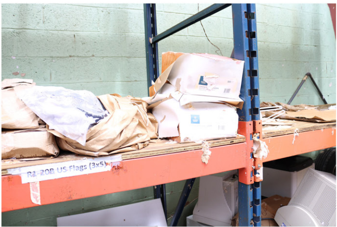
Fixed Assets Management_118.jpg