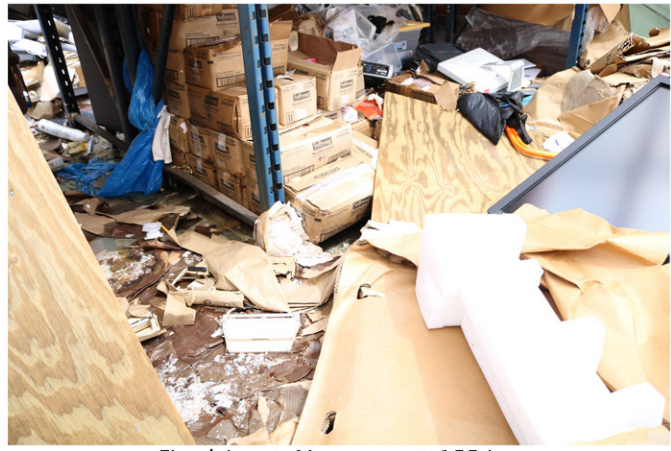
Fixed Assets Management_155.jpg