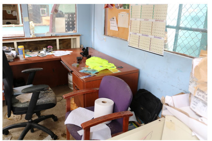
Fixed Assets Management_097.jpg