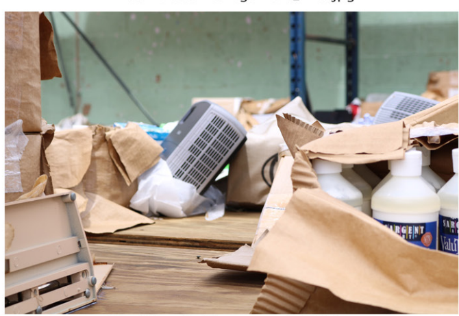
Fixed Assets Management_156.jpg