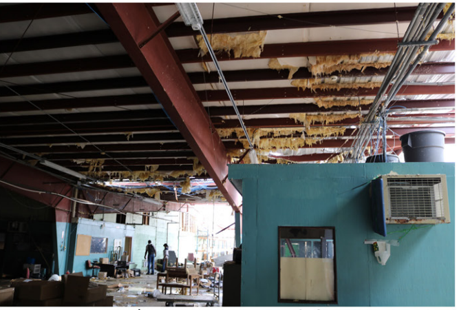
Fixed Assets Management_072.jpg