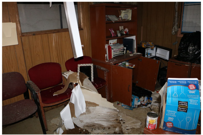
Fixed Assets Management_197.jpg