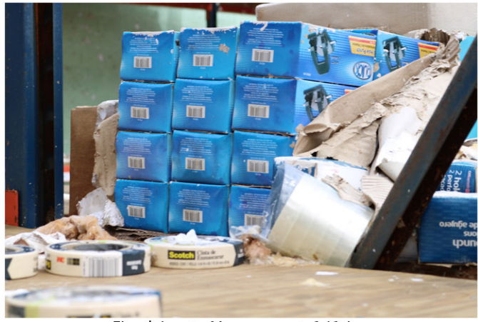
Fixed Assets Management_141.jpg