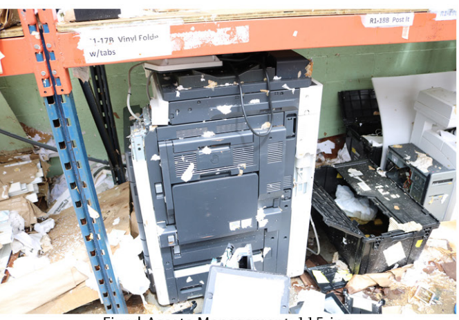
Fixed Assets Management_115.jpg