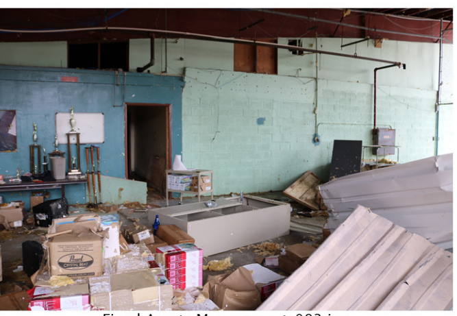
Fixed Assets Management_093.jpg