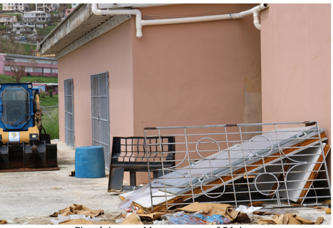
Fixed Assets Management_051.jpg