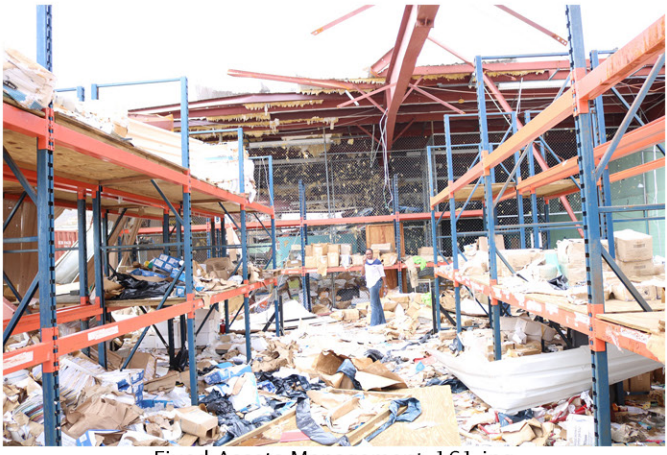
Fixed Assets Management_161.jpg