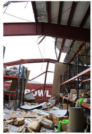
Fixed Assets Management_104.jpg