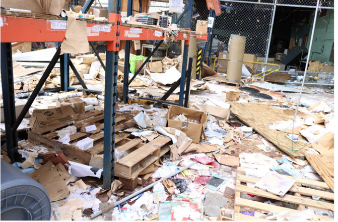
Fixed Assets Management_110.jpg