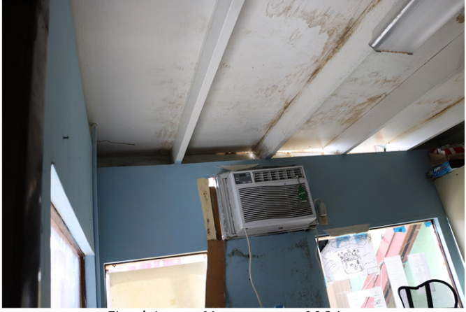
Fixed Assets Management_096.jpg