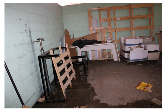
Fixed Assets Management_078.jpg