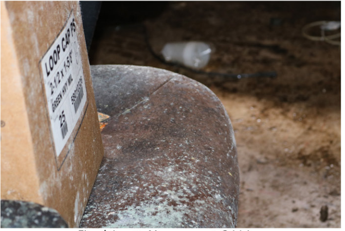
Fixed Assets Management_244.jpg