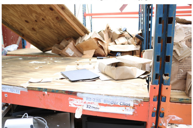
Fixed Assets Management_128.jpg