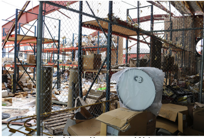
Fixed Assets Management_101.jpg