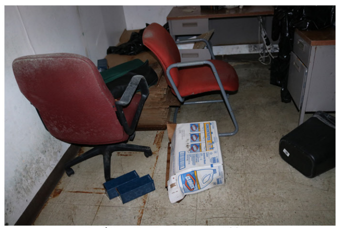
Fixed Assets Management_169.jpg