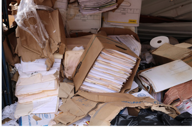
Fixed Assets Management_143.jpg