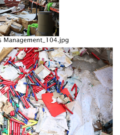
Fixed Assets Management_107.jpg