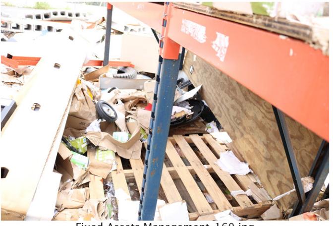
Fixed Assets Management_160.jpg