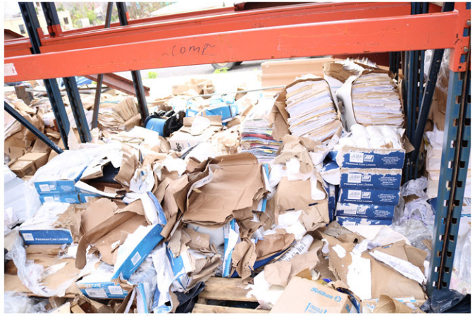
Fixed Assets Management_146.jpg