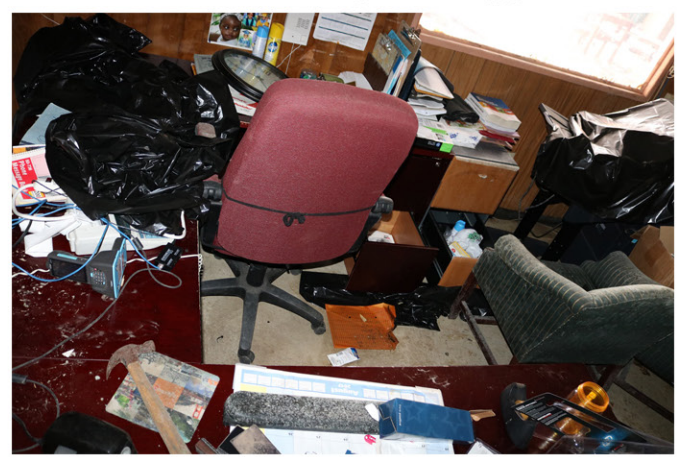
Fixed Assets Management_173.jpg