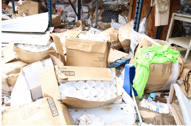
Fixed Assets Management_133.jpg