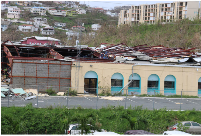
Fixed Assets Management_255.jpg