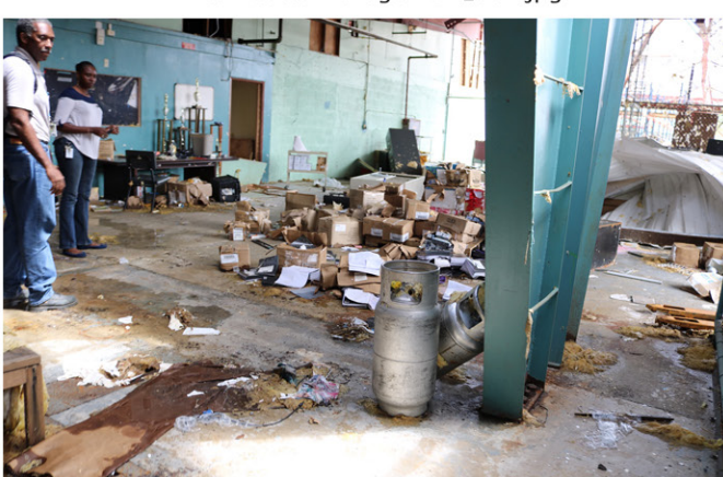
Fixed Assets Management_065.jpg