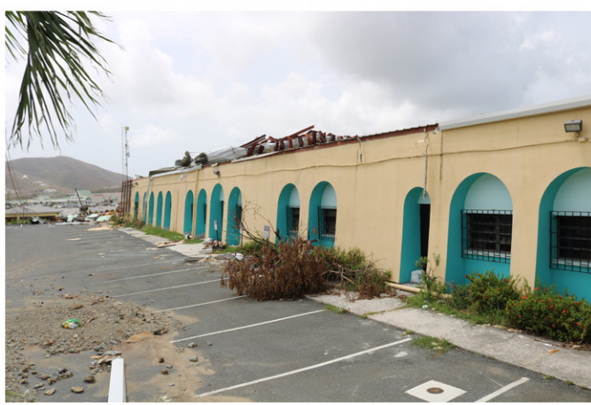
Fixed Assets Management_012.jpg