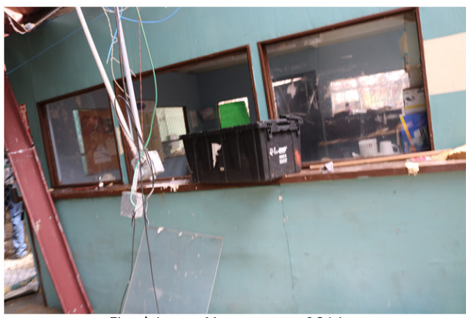
Fixed Assets Management_064.jpg