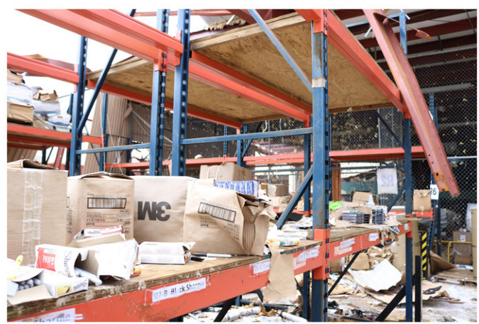
Fixed Assets Management_109.jpg