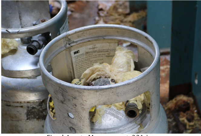
Fixed Assets Management_231.jpg