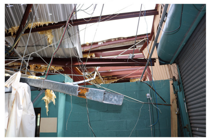
Fixed Assets Management_056.jpg