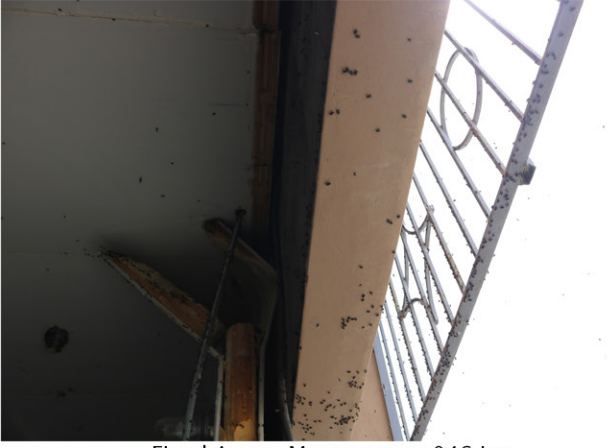
Fixed Assets Management_046.jpg