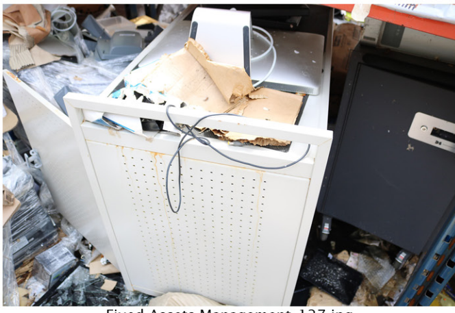
Fixed Assets Management_127.jpg