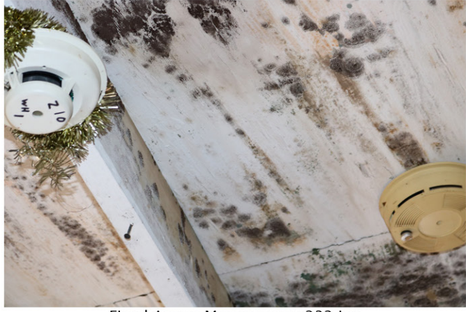
Fixed Assets Management_232.jpg