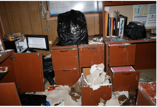
Fixed Assets Management_198.jpg