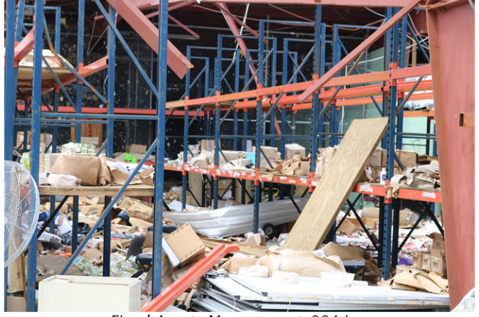
Fixed Assets Management_004.jpg