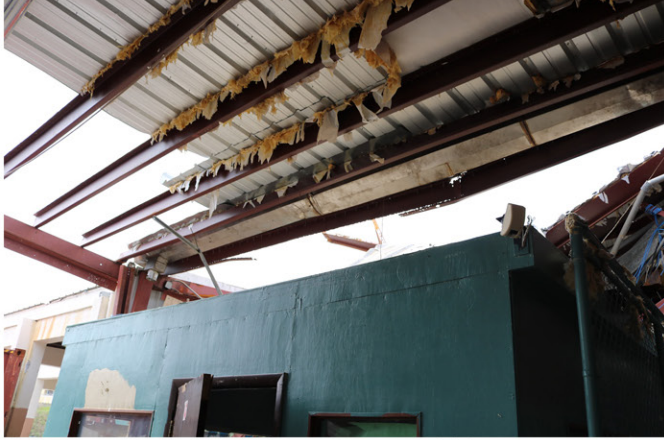
Fixed Assets Management_086.jpg