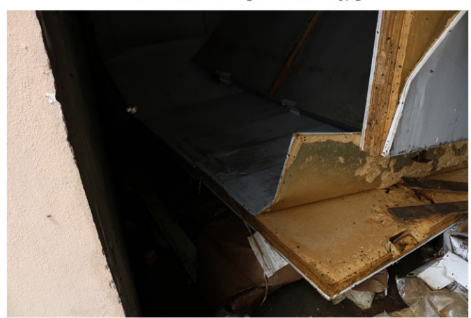
Fixed Assets Management_041.jpg