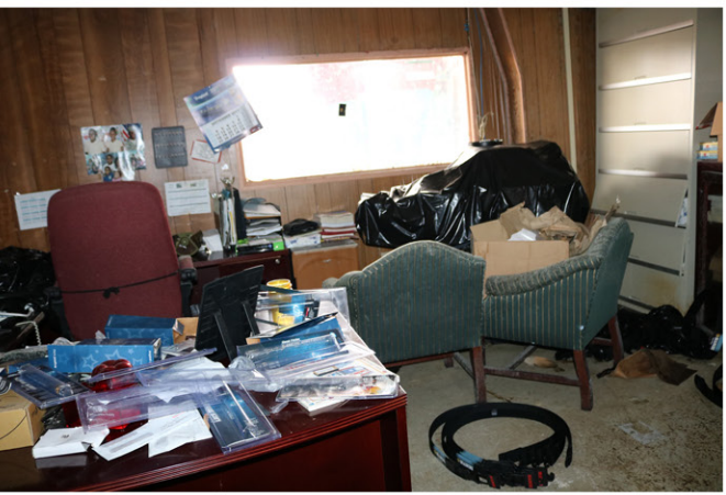
Fixed Assets Management_165.jpg