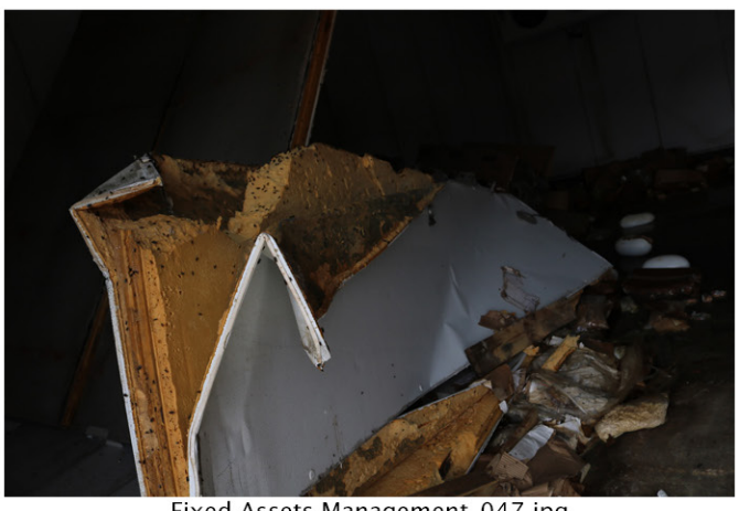
Fixed Assets Management_047.jpg