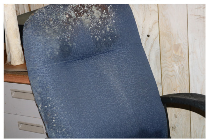
Fixed Assets Management_241.jpg