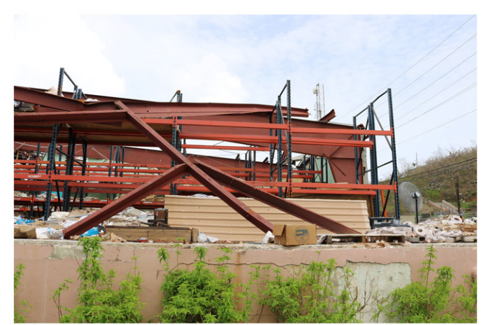
Fixed Assets Management_001.jpg