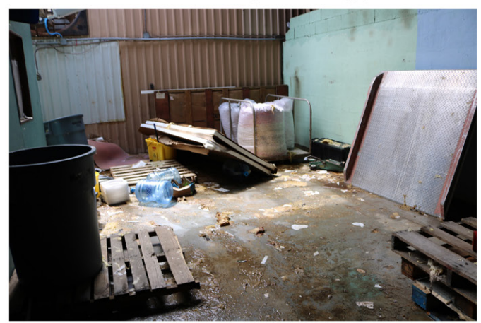
Fixed Assets Management_067.jpg