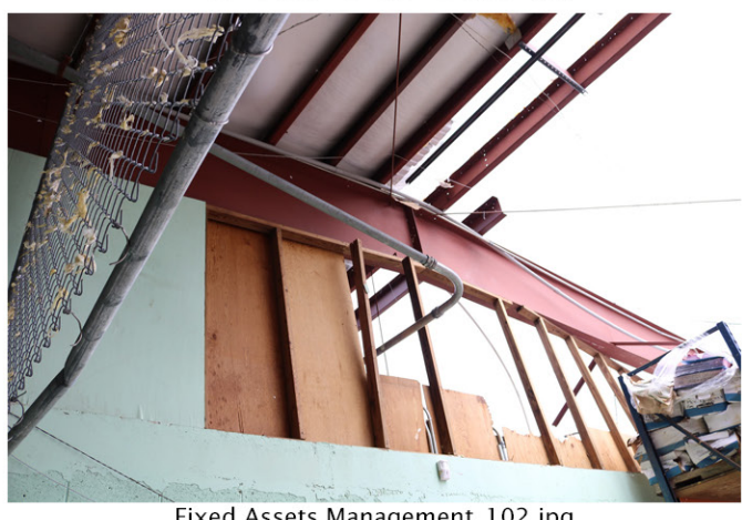
Fixed Assets Management_102.jpg