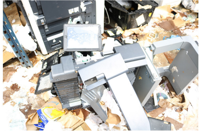
Fixed Assets Management_114.jpg