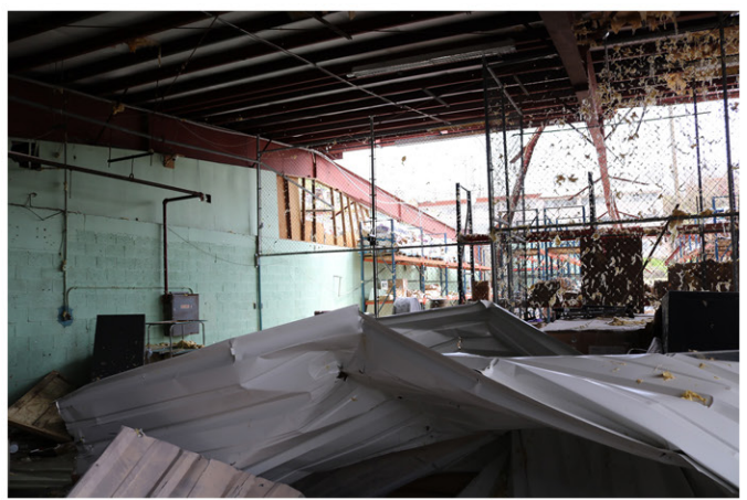
Fixed Assets Management_092.jpg