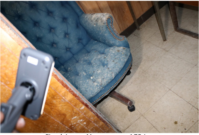
Fixed Assets Management_175.jpg