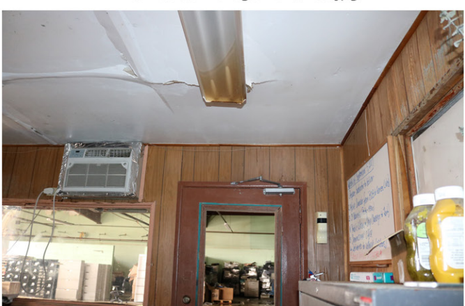
Fixed Assets Management_166.jpg