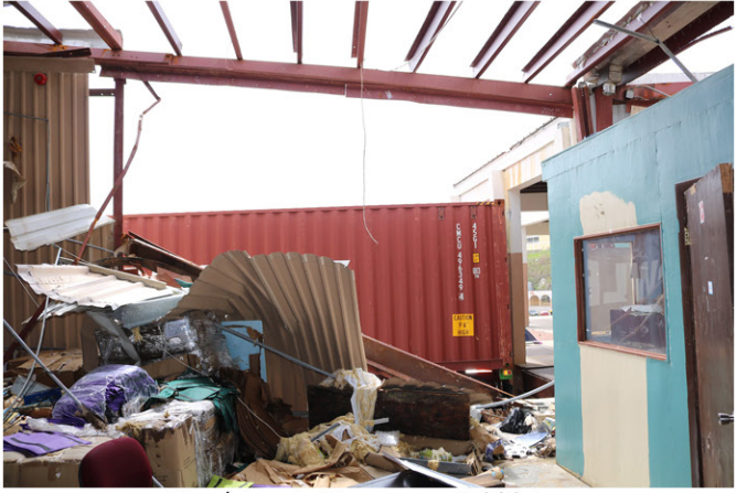
Fixed Assets Management_090.jpg