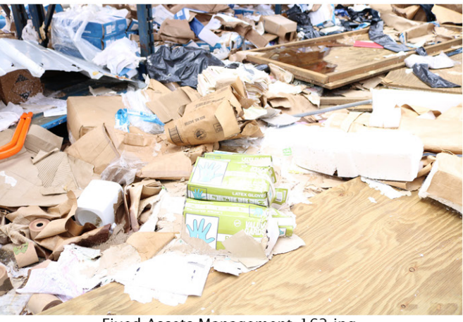
Fixed Assets Management_162.jpg