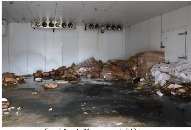
Fixed Assets Management_042.jpg