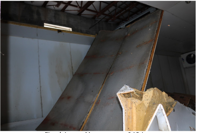
Fixed Assets Management_048.jpg