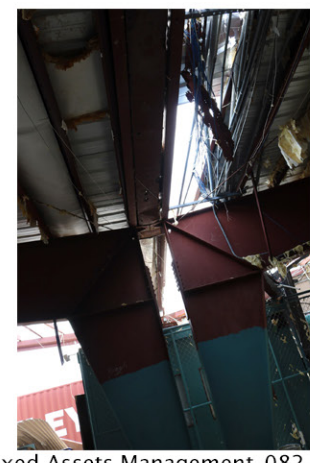
Fixed Assets Management_082.jpg