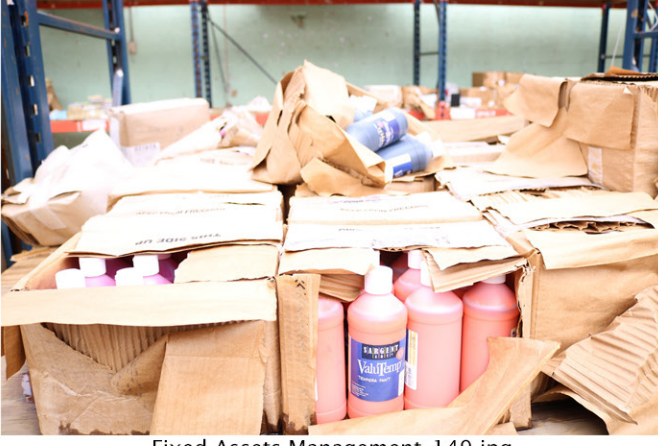
Fixed Assets Management_149.jpg