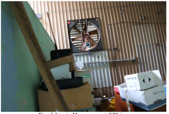
Fixed Assets Management_070.jpg