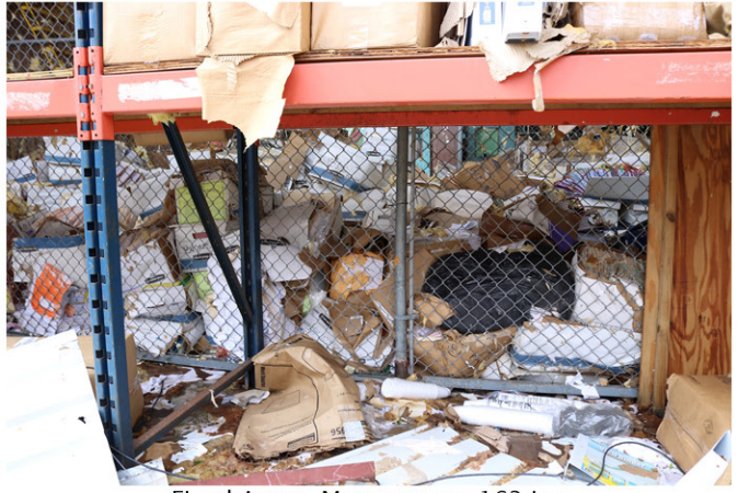
Fixed Assets Management_163.jpg