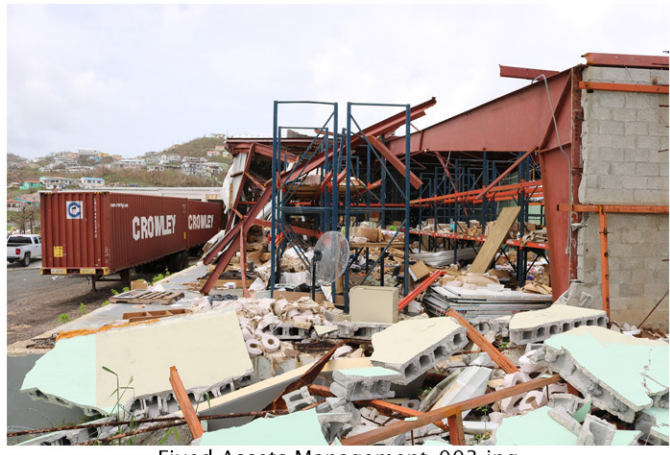
Fixed Assets Management_003.jpg