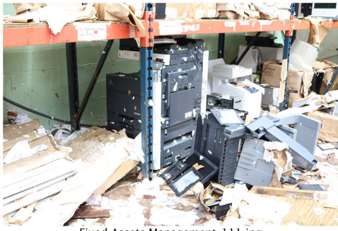
Fixed Assets Management_111.jpg