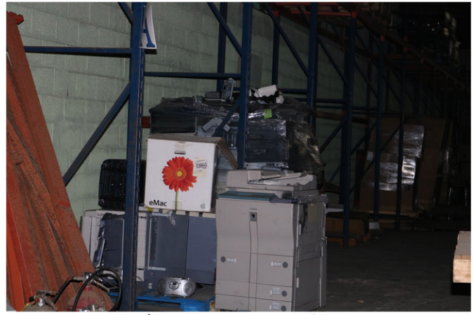
Fixed Assets Management_075.jpg