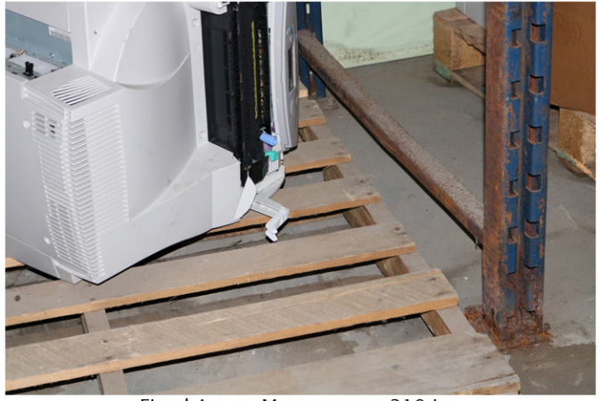
Fixed Assets Management_219.jpg