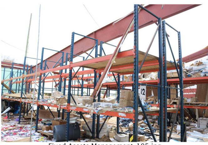
Fixed Assets Management_105