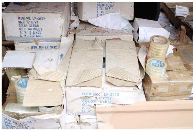
Fixed Assets Management_138.jpg