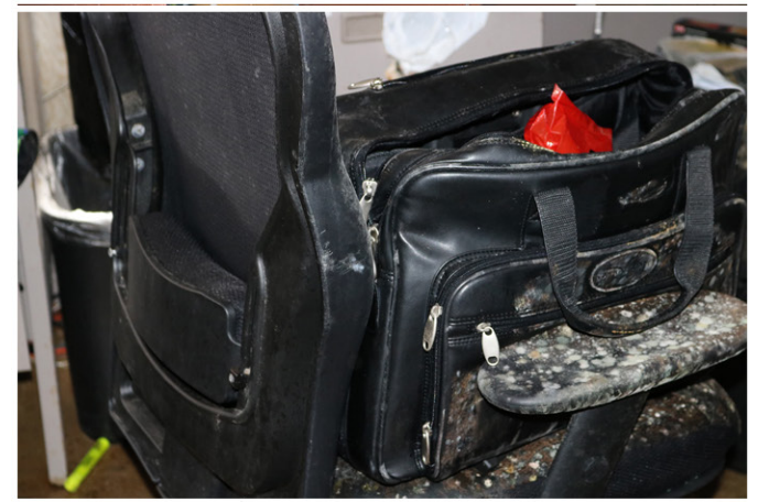
Fixed Assets Management_238.jpg