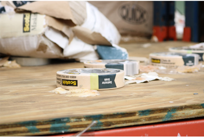
Fixed Assets Management_140.jpg