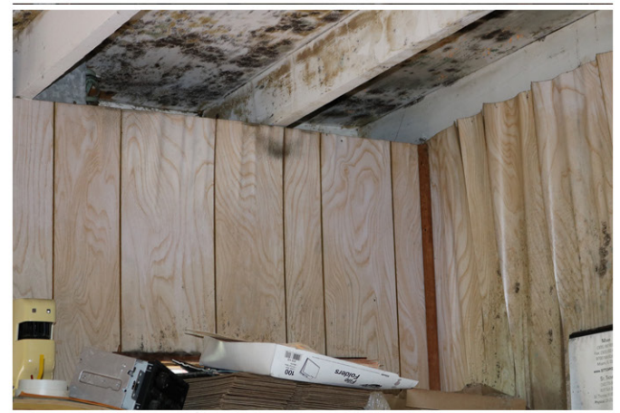
Fixed Assets Management_239.jpg