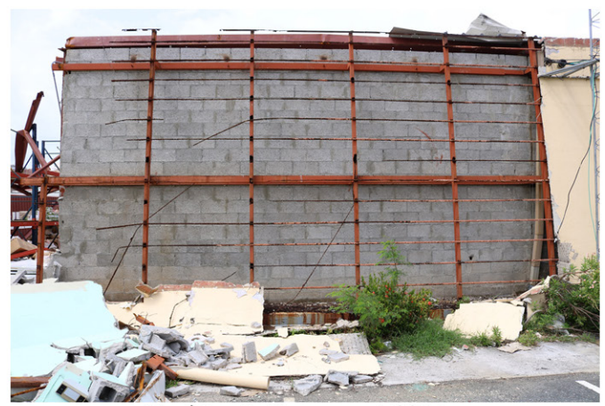
Fixed Assets Management_005.jpg