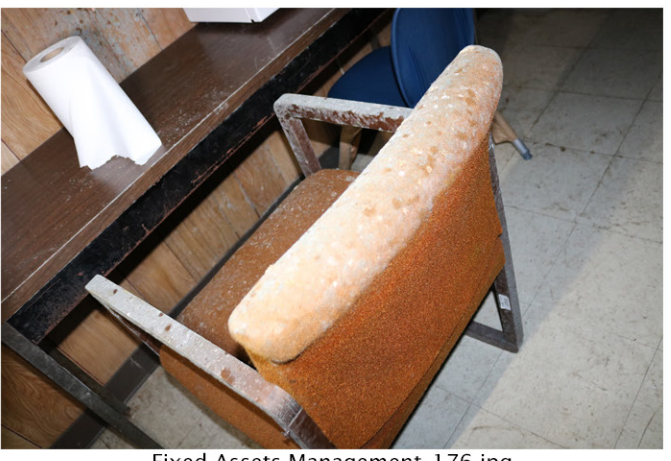
Fixed Assets Management_176.jpg