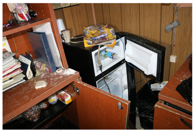
Fixed Assets Management_200.jpg