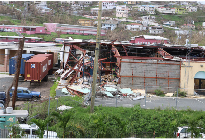
Fixed Assets Management_253.jpg