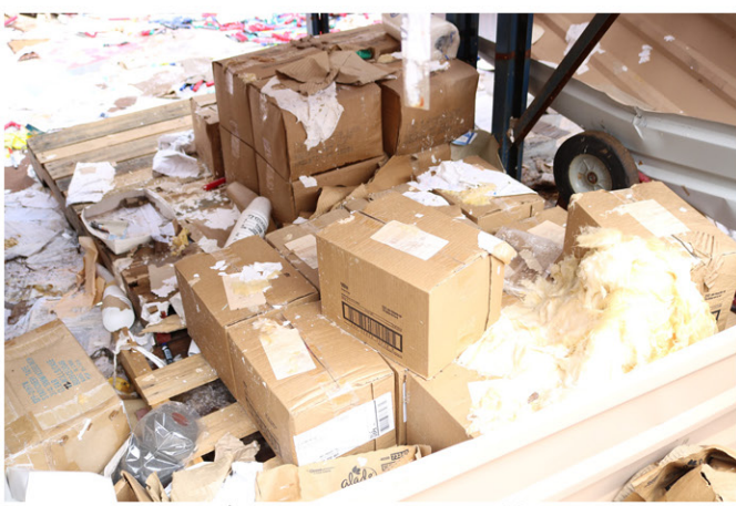
Fixed Assets Management_139.jpg